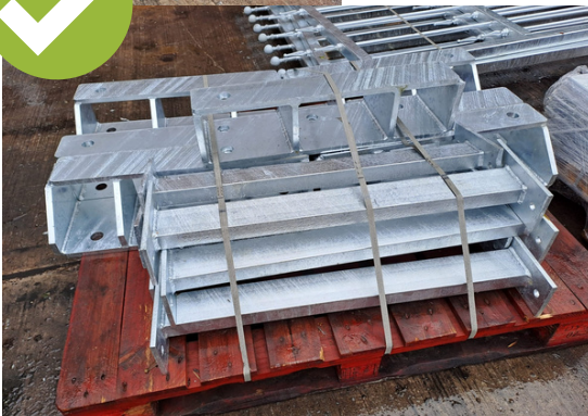
Weight kept low and central (No layer heavier than the one beneath it)