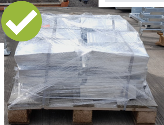
Shrink- wrapped (as necessary)