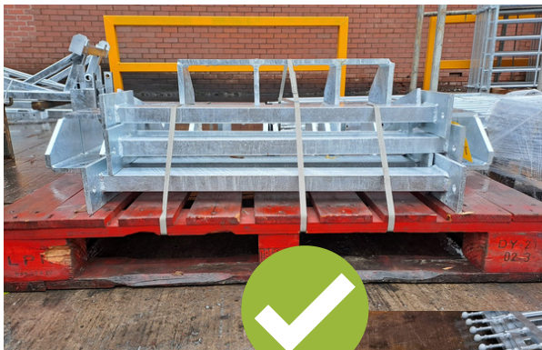
Banded to a pallet